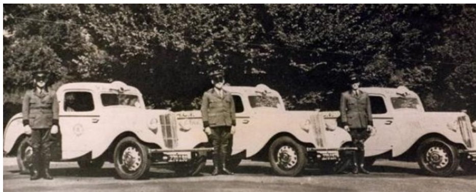
The grill and 'easy-clean' wheels suggest they are Series II chassis. (Ed)

These little road service coupes were operated by the RACV in Victoria – I don't know anything about them. The original photo is somewhere in my collection and that has a brief description on the back, but I can't find it at this moment. I scanned it years ago and didn't make a note of the inscription.