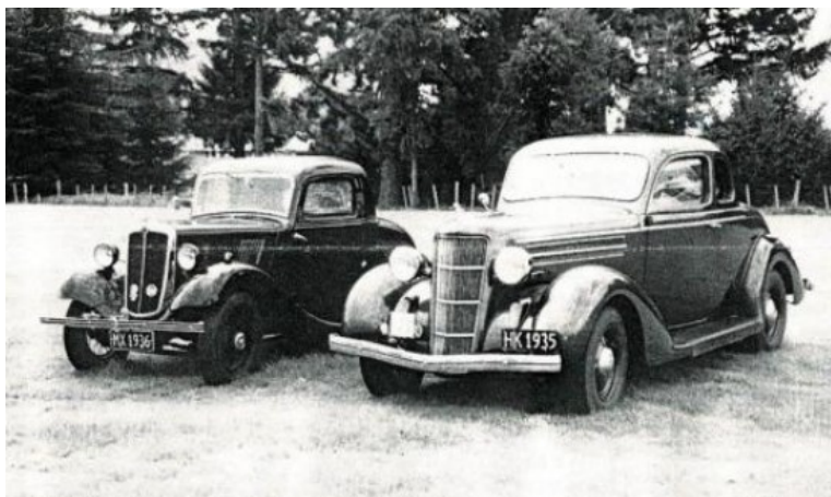
MX1936 - sizing up to a 1935 Dodge DU Coupe