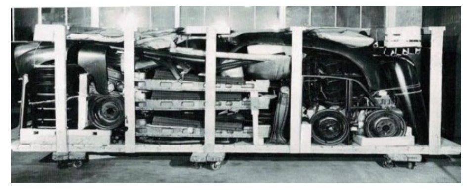
CKD (complete knock down) Morris Minor as packaged for export to NZ by Morris Export Industries Ltd in UK.