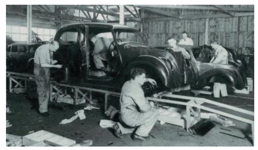
Series E being assembled at Newmarket (Auckland) in late 1940's

Walter Norwood stated:"The motorist in NZ wants an economical low-priced car. We have a fine roads system; quite as good as England ... petrol costs 2 shillings a gallon. Therefore, the 8hp British car is preferred to the American machine. We sell all cars, but 85% are British".