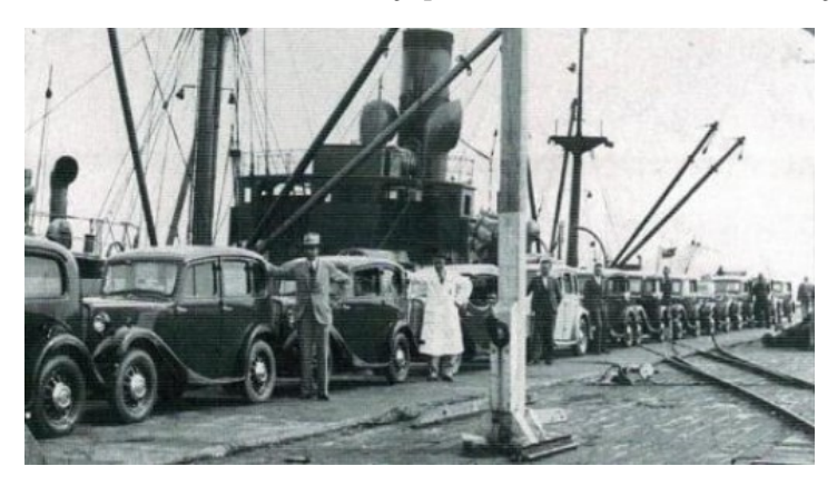
Cars were distributed around NZ by coastal traders – this is a line-up of M8 Sedans on the Napier wharf