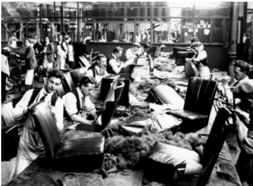
Upholstery workers at the Morris factory in the 1930's

http://imageweb-cdn.magnoliasoft.net/motormuseum/fullsize/1193780.jpg