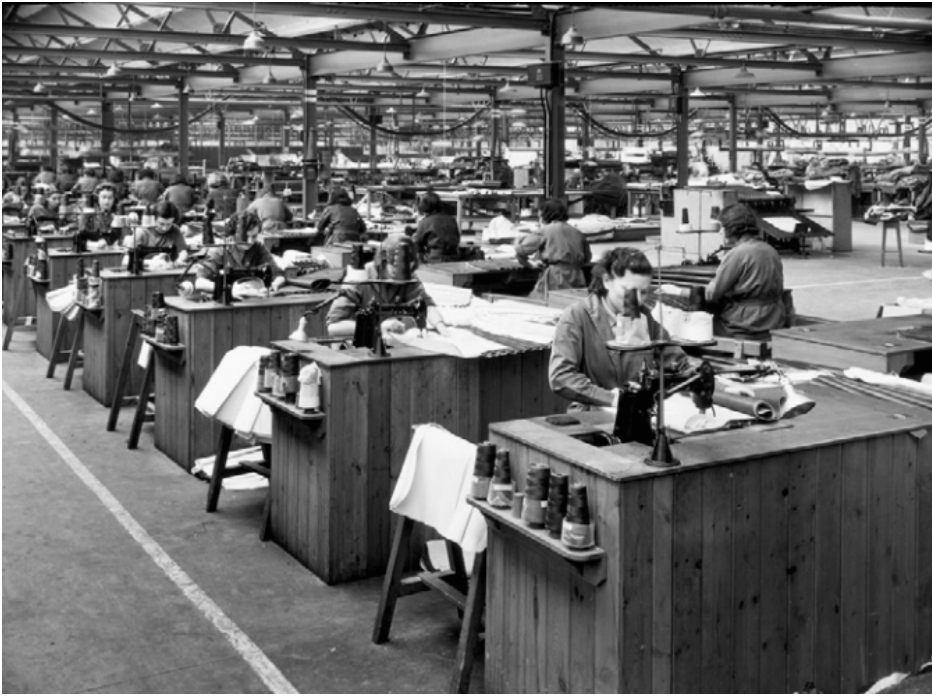
Upholstery workers at the Morris factory in the 1950's